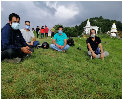
Discussion with the representative of LDAG and DHC Bhaktapur

The Listening, Discussion and Action Group (LDAG) Dolakha are actively supporting various Wards in the district during the pandemic. The Kamalamai Radio Listener Group Sailung gaunpalika-04 , Maghapauwa organized various awareness programs against COVID-19 and supported the local government in relief distribution. The group was involved in the maintenance of drinking water supply source, road maintenance and organized different WASH activities, after the initial confusion during the lockdown. The group closely monitored the relief distributed by the local government. The group is working in close coordination with the civil societies and elected representatives during the pandemic.